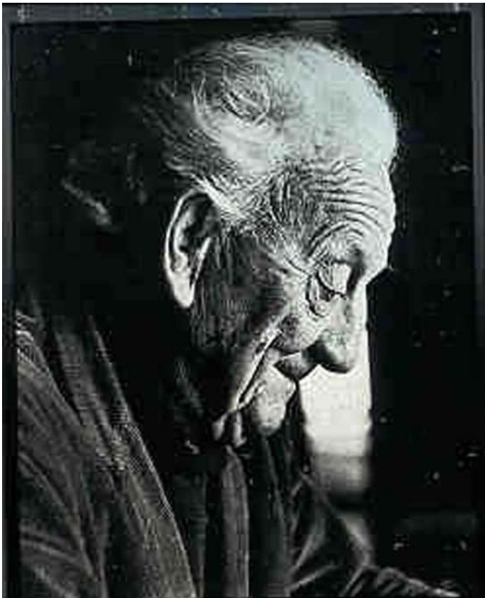
Fig. Albert. Professor Albert Szent-Györgyi, 1893 – 1986.

The mechanism of muscle contraction has been extensively studied in the 20 th century. At the beginning, physiologists looked on muscle as a machine that can generate power, heat, and has electrical properties. Later, the question was raised what is the composition of the machine and what is the energy it utilizes. The central role of proteins in contraction has been recognized when Albert Szent-Györgyi (Fig. Albert) demonstrated that muscle contraction could be reproduced in vitro by adding ATP to actomyosin threads (Fig. AM). This put muscle research into a high gear. The book of Szent-Györgyi (1951) describes the classical experiments carried out in his laboratory, in Hungary, during the Second World War.