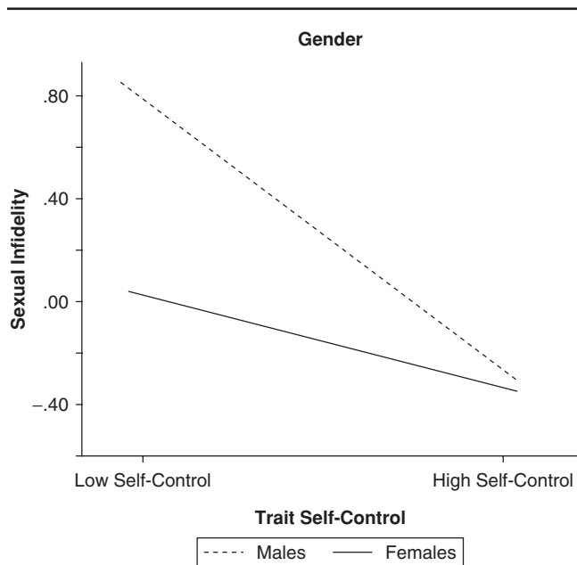
Figure 2 Participants' reported likelihood of engaging in sexual infidelity as a function of trait self-control and participant gender (Study 2).

simple effects of depletion condition among those high and low in trait self-control. These results are consistent with the results of Study 1 and suggest that high trait self-control does not prevent depletion.