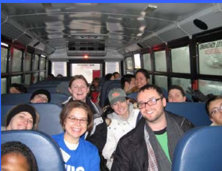
The January PASA team on their bus waiting to go to the Marcy Center.