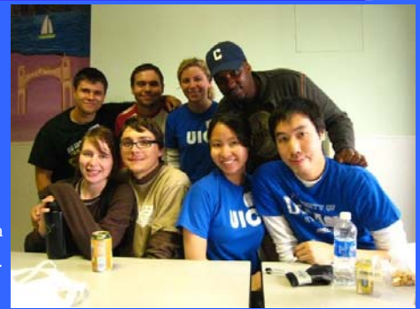
The summer PASA team takes a break from their work for a snack and a picture.