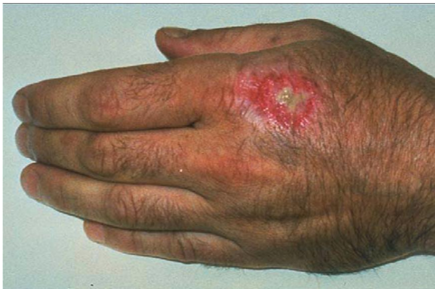
Small HF burn from grease which had absorbed a little HF. Immediate washing with water and application of calcium gluconate gel resulted in full recovery. Photo taken a couple days after exposure.