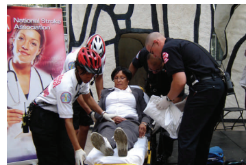
Stroke Alert Day, Mock Stroke Code Illinois

Discussion: Collaboration between EMS responders and hospital providers can help minimize the time required for stroke patients to receive care. One way that this can happen is by having EMS responders notify the hospital of a potential incoming stroke patient. 2 This increases the likelihood that hospitals will quickly receive and treat the stroke patient. 2, 37 It is a recommended measurement parameter that pre-arrival notification of hospitals is provided for all suspected stroke patients by the ASA Expert Panel on EMS. Additionally, providing ongoing feedback to EMS providers who care for and transport stroke patients is also recognized. 2 A survey recently conducted in Indiana found that 53% of respondents notify the destination hospital with the information that they are treating/transporting a possible acute stroke. However, 57% do not have a written protocol or policy to determine where acute stroke patients are transported. 9 In a survey conducted in Minnesota, it is a policy for the majority (N = 155, 79%) of respondents to provide advance notice to hospitals regarding stroke patients who need urgent care. Data has not been collected on the communication between emergency departments and EMS providers regarding feedback on stroke patients. 7