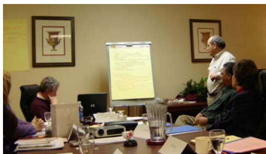
State Advisory Board Meeting, January 2006.

No single state or program can provide all the adequate resources needed. However, there is power in numbers that can bring about change. Crossing state lines, sharing knowledge, resources and leadership is a step towards reducing the third leading cause of death.