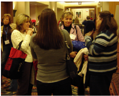
Partnership with the National Stroke Association Stroke Team Meeting, December, 2006.

No single state or program can provide all the adequate resources needed. However, there is power in numbers that can bring about change. Crossing state lines, sharing knowledge, resources and leadership is a step towards reducing the third leading cause of death.