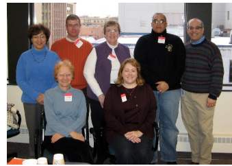
State Advisory Board, 2008.

The Great Lakes Regional Stroke Network is a regional partnership of state Heart Disease and Stroke Prevention Programs, state partners and national organizations as well as state stroke task forces in Illinois, Indiana, Michigan, Minnesota, Ohio and Wisconsin.