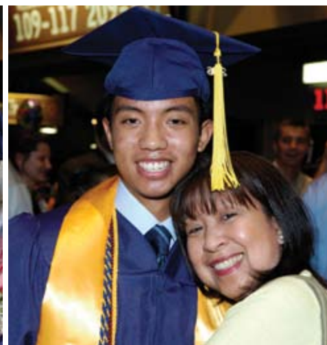
In May, hundreds of students, their families and friends gathered in the UIC Pavilion to celebrate the 2006 Honors College graduating class.