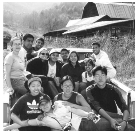
The group who travelled to North Carolina over Spring Break became very close, as you can tell from this photo!

The Alternative Spring Break trip that I went on to Madison County, North Carolina was absolutely unbelievable. It's crazy how in just one week you can feel so close to people you had hardly known before, and how new experiences can change the way you view the world forever. As the fourteen of us entered the county that we were going to live in for the week, we could immediately tell that it was going to be so different from the bustling city of Chicago that we were all used to. Located near the Appalachian Trail in the Smoky Mountains, the scenery was beautiful, the town was quiet, and our surroundings were simple in a quaint, peaceful kind of way. We were going to live in a 200-person town where everybody knew each other and where generosity and kindness were a way of life.