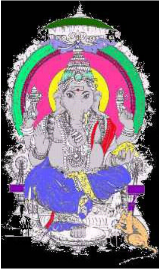
For more information on Carnatic music, visit: http://www.synflux.com.au/~mohan/music.html