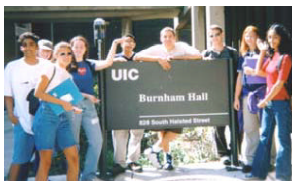
These new students already look at home at their new Honors College home in Burnham Hall!