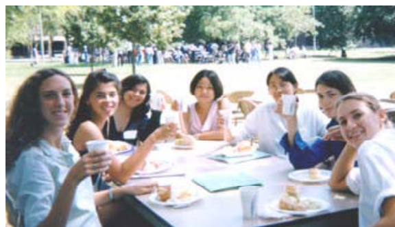
Enjoying lunch at New Student Day on 8/21

So, as the year begins, before classes become too hectic or personal lives become too complicated, I propose that we all take the time to explore something that might initially make us feel like a fish out of water. We have all identified ourselves at different times as American; maybe it is time to define ourselves in terms of other cultures. Let’s all “melt a little.” For example, right now, I’m going to get myself some kim chi. Nothing like cabbage to make you feel better. Try it. You might like it.