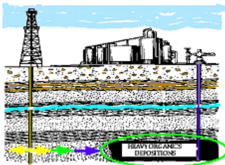
Figure 1: An example of heavy organics deposition in petroleum production

One of the major unsolved complex systems confronting the chemical, petroleum, food and pharmaceutical industries at present is the untimely deposition of heavy organic and other solids dissolved or suspended in the fluid flow systems. The production, transportation and processing of chemicals, petroleum and other industrial fluids could be significantly affected by flocculation and deposition of such compounds in the course of industrial processing systems including transfer conduits, reactors and refinery and upgrading equipment with devastating economic consequences [1-6].