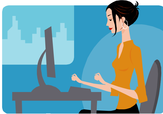
It's once again time to register online.

You must look up your Spring 2007 Advance Registration Time Ticket (Appointment) on UIC Web for Student under registration eligibility. Also, check to make sure there are no holds on your account preventing you from registering on your assigned date and time.