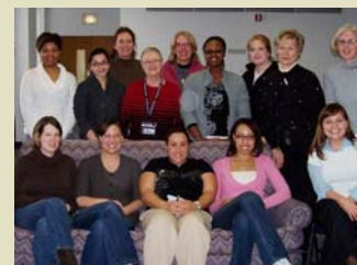
APFN Program's first cohort