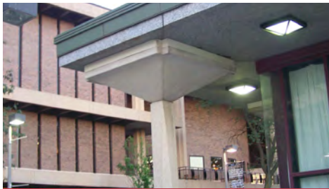
UIC's east campus.

APAC Committee Members 2009-2010 Campus-wide elections are held in March